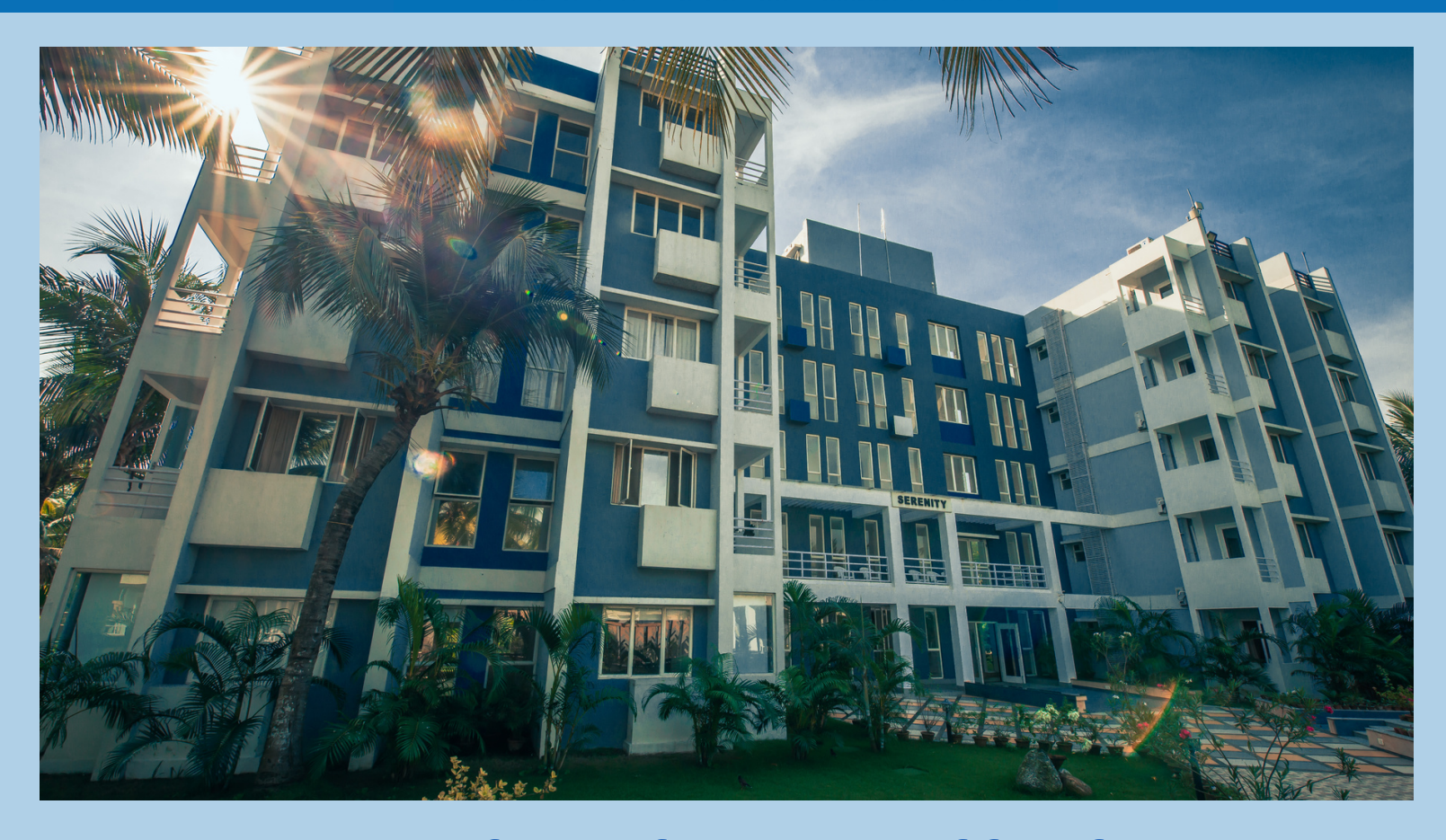
Suites designed to suit your lifestyle